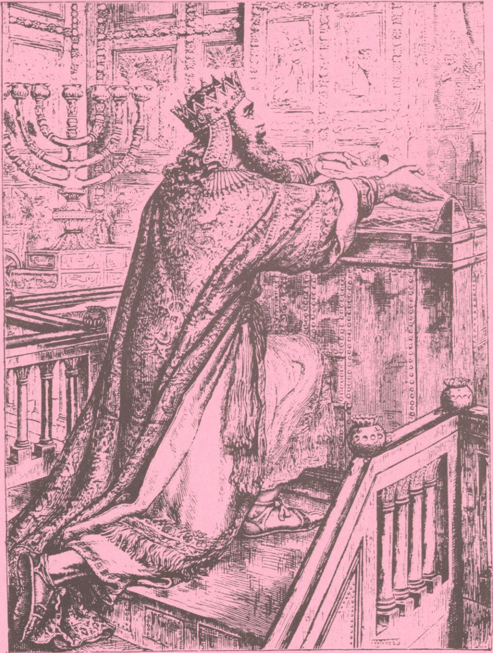
Hezekiah laying the Letter before God (see note on page 21)